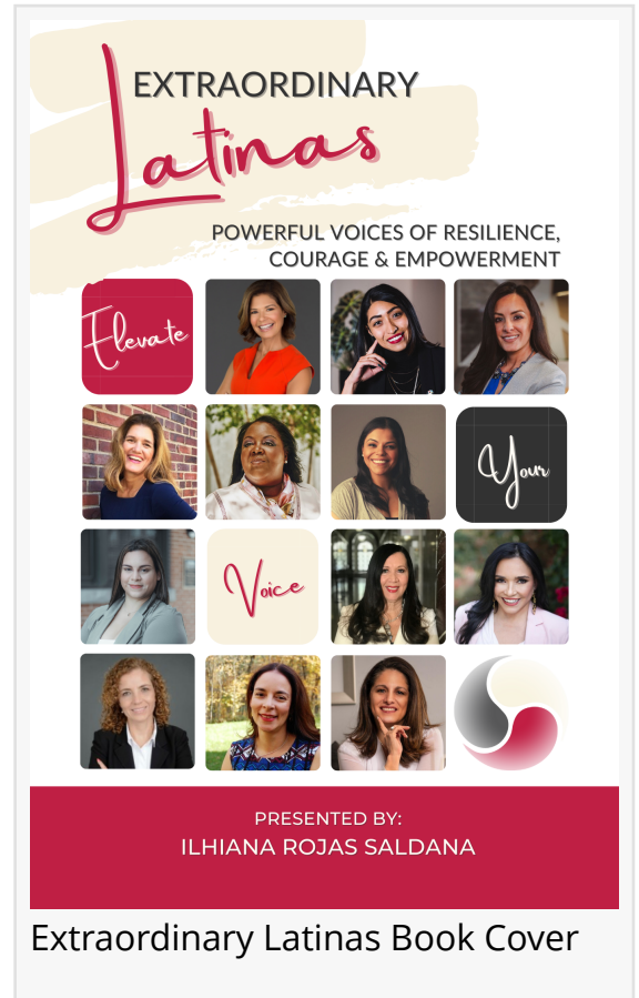
Extraordinary Latinas Book Cover