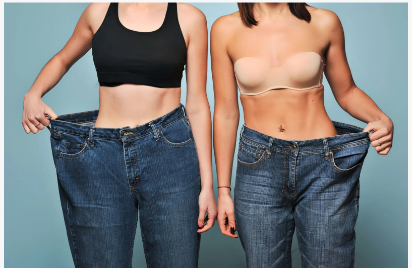
Tailor Made Weight Loss Programs ©The Skinny Center