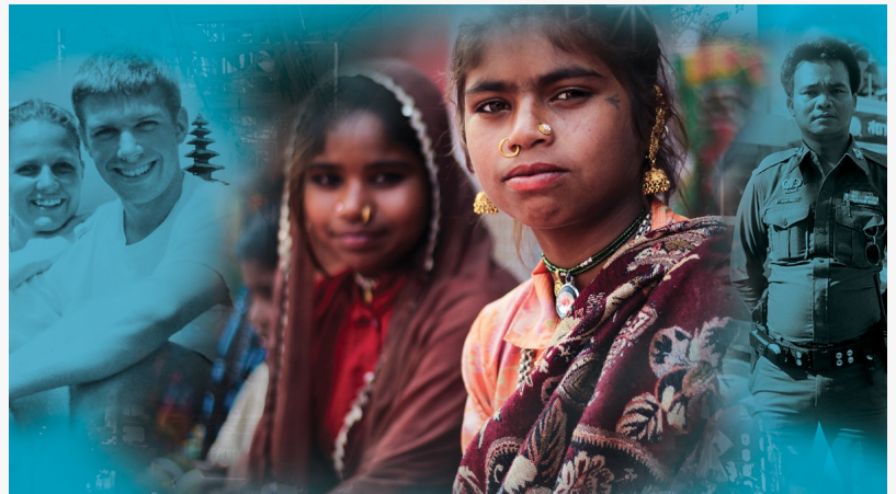
An ordinary couple that chose to fight human trafficking founded The Exodus Road.

EINPresswire.com/ -- "Justice is in the hands of the ordinary." Visitors can find this statement on the walls of The Exodus Road's office, on their website and in most interactions with team members. The idea that anyone can make an impact in the fight against human trafficking led to the formation of the Colorado Springs-based, counter-trafficking nonprofit. It also spurred the creation of their new, free training platform, TraffickWatch Academy: U.S., which will release on Sept. 21.