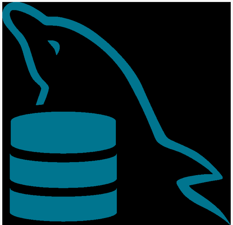
MySQL to FileMaker Conversion

MySQL is one of the most popular database platforms in use today. FileMaker Pro is widely recognized for being the leading low-code database development platform. FmPro Migrator brings these two database platforms together by offering bi-directional schema and data transfers between them. FileMaker Pro developers can help companies skip IT scheduling bottlenecks by moving SQL database apps into FileMaker Pro solutions.