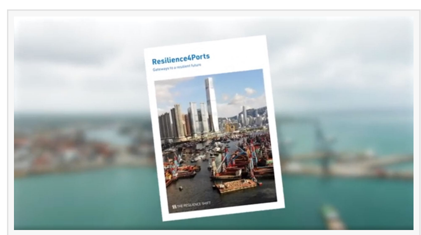
Resilience4Ports: Gateways to a resilient future features in new film

LONDON, LONDON, UNITED KINGDOM, September 14, 2021 /EINPresswire.com/ -- The Resilience Shift has participated in a new film on ports, Gateways to Growth, commissioned by the UK Chamber of Shipping and the British Ports Association.