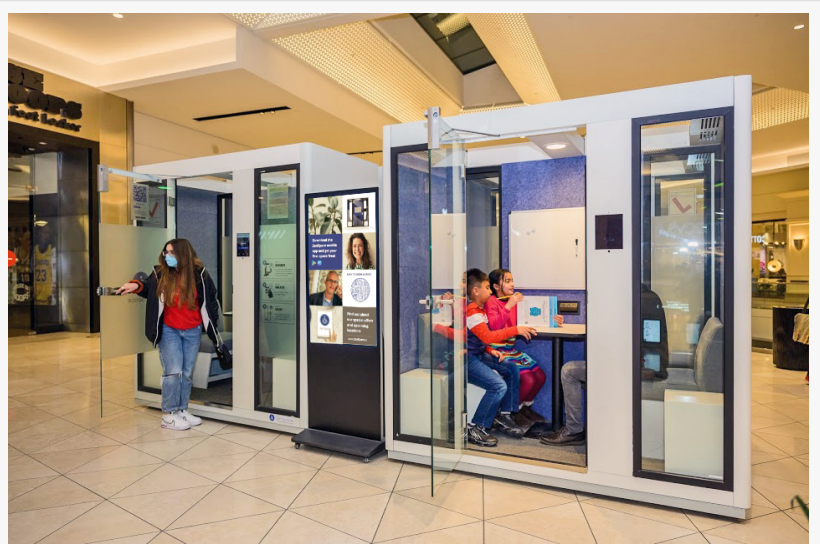
Westfield Valley Fair Pods In Use

INVEST in ZenSpace? https://www.startengine.com/zenspace