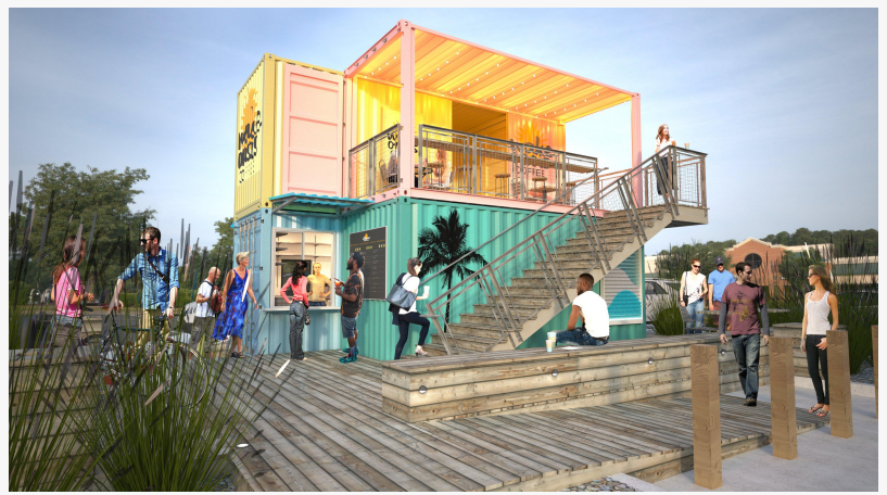
WAKE OASIS COFFEE DRIVE THRU MODULAR SHOP - STREET VIEW Wake Oasis Coffee, a novel drive-thru modular box shop concept utilizing convertible shipping containers to create a very unique aesthetic.

To learn more about Wake Oasis Coffee and becoming a developer partner, investor, or