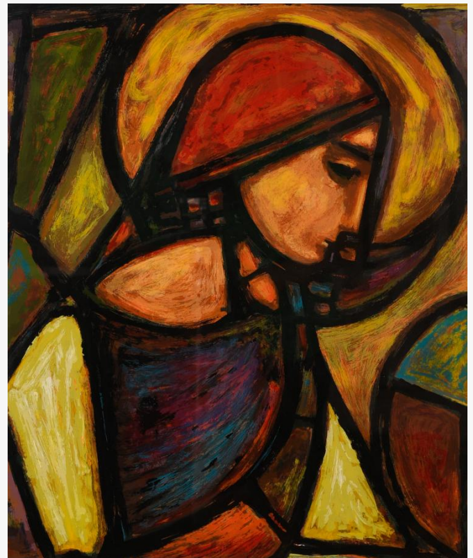
Anthony Quinn "Ideal Woman"