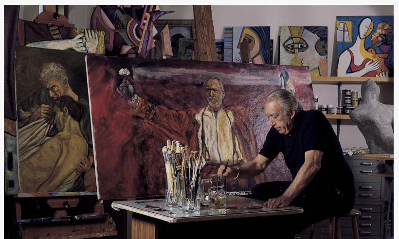
The Artist Anthony Quinn