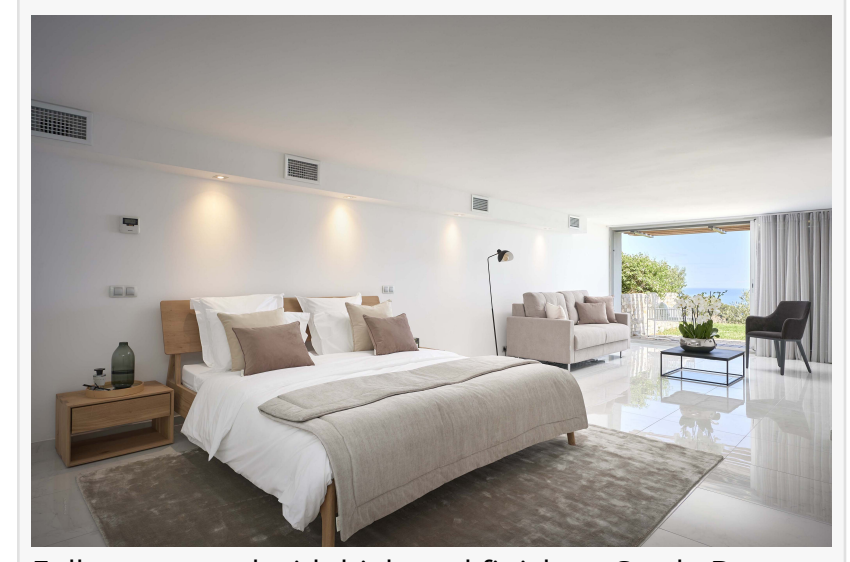
Fully renovated with high-end finishes, Castle Bay embodies the best of the French Riviera plus an unbeatable view.

Full southern exposure ensures the interior of the residence, decorated in a clean minimalist and contemporary style, stays bathed in warm natural light.