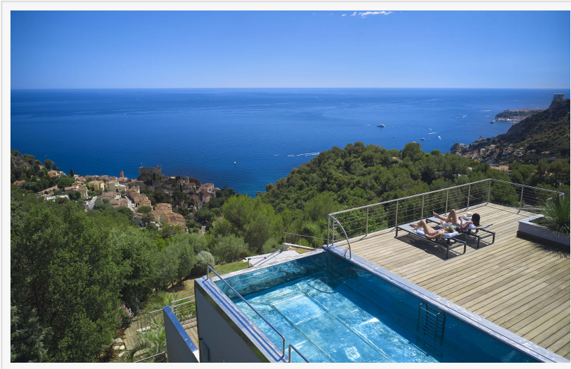
Bask in the jaw-dropping panoramic views of the Mediterranean, where the warm ocean waters stretch towards the horizon.

light. An infinity pool is the crown jewel of the rooftop terrace, with its water cascading down to the terrace below. Fully renovated with high-end finishes, Castle Bay embodies the best of the French Riviera plus an unbeatable view. Additional features include: a large fully fitted kitchen with Gaggenau appliances; a formal dining room; the possibility for a second rooftop infinity pool; electric gate, video surveillance, and an alarm system—all just 15 minutes from Monaco or 35 minutes to Nice.