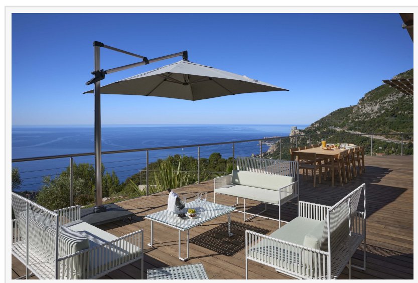
If the walls of windows throughout aren't enough to enjoy the spectacular views, the residence is wrapped in a staggering 655-square-meters of decks and terraces.

This press release can be viewed online at: https://www.einpresswire.com/article/551474192