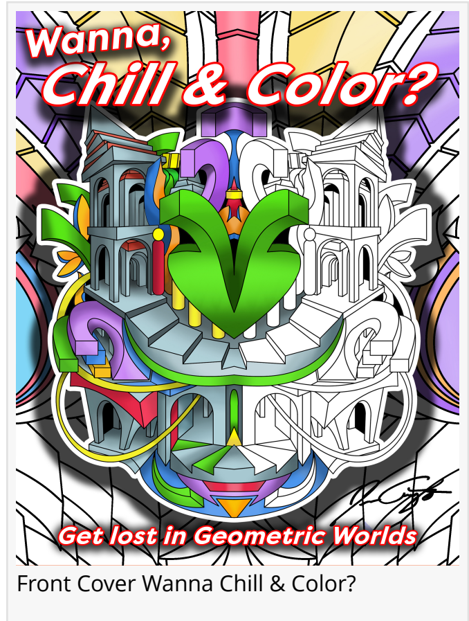
Front Cover Wanna Chill & Color?