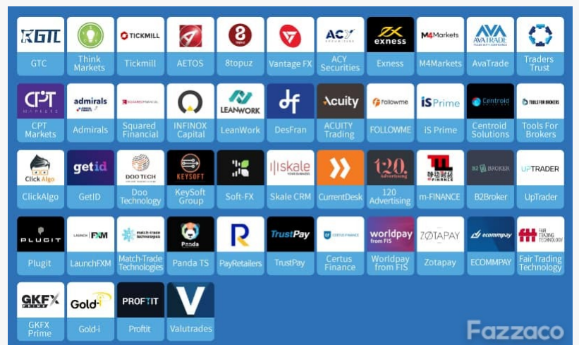
Fazzaco company pages in recent months