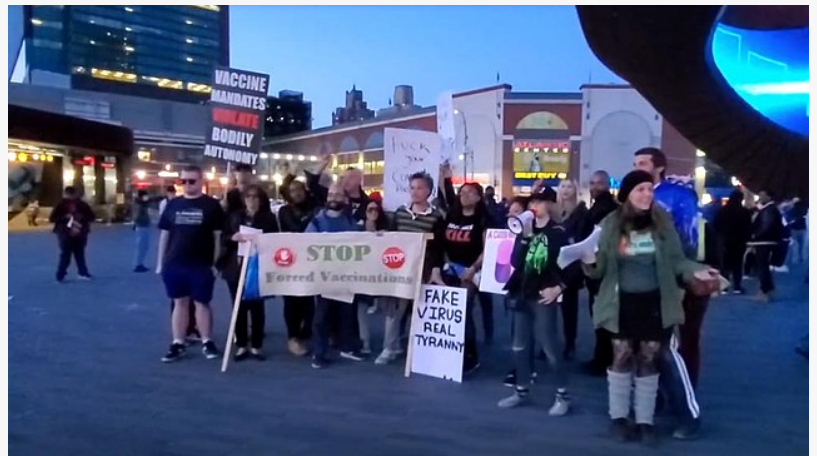
New York Liberty Coalition speaking out against mandatory vaccine passports at Barclays Center in Brooklyn

UTICA, NY, UNITED STATES, September 16, 2021 /EINPresswire.com/ -- This week, United States District Judge David Hurd granted a preliminary injunction that blocks the State of New York from mandating medical workers to be vaccinated. A group of health care workers had sued, arguing that their Constitutional rights had been violated because the state's mandate disallowed religious exemptions.