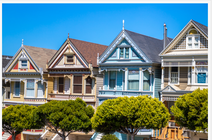
UMBRA Homes in California

The results of HUD's 2020 report were scheduled to be announced by fall 2020, but due to unknown reasons, President Donald Trump hid the results from the public for several months. If we are to guess the arrival of January 2021's survey report, we might have to wait a few more months.