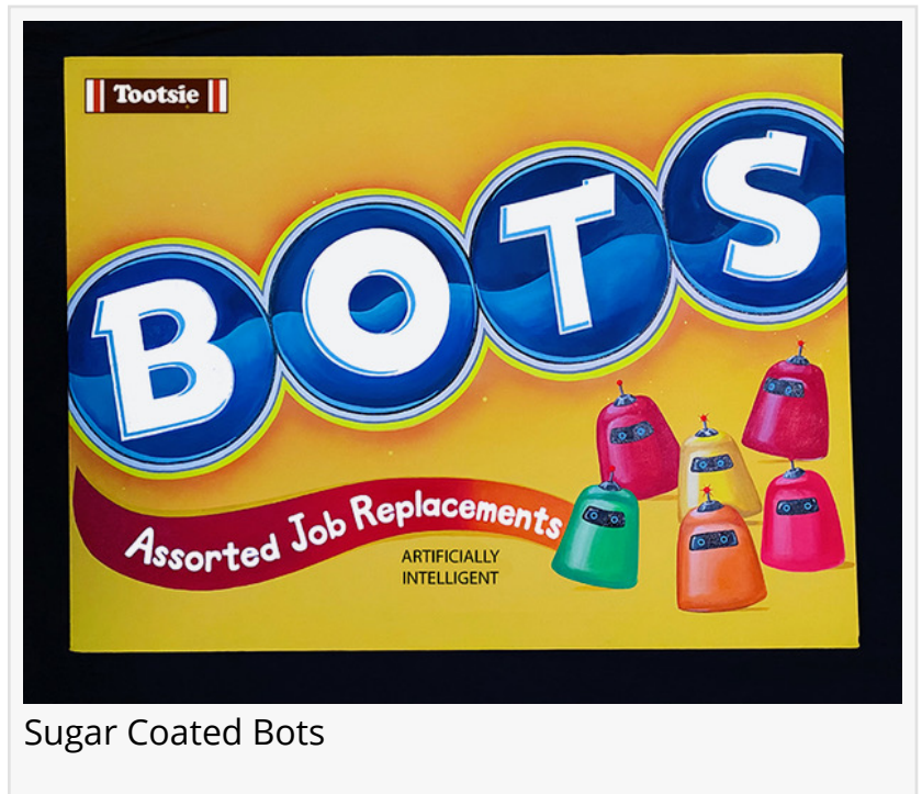
Sugar Coated Bots