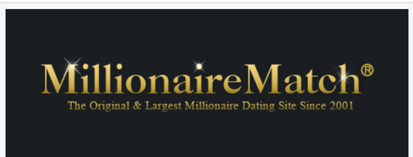
MillionaireMatch.com - The Original & Largest Millionaire Dating Since 2001

Designed specifically for successful and attractive singles looking for a serious, long-term relationship, MillionaireMatch is home to over 5,000,000 influential members and facilitates over 2,000,000 messages between users each month. The dating site is frequented by pro athletes, doctors, lawyers, investors, entrepreneurs, beauty queens, supermodels, and Hollywood celebrities all looking for meaningful partnerships. To ensure quality and trust, members are verified by income and photos to confirm their identity. Having been featured on CNN, ABC, and CBS, and voted "Best of the Web" by Forbes.com, MillionaireMatch continues to be the place