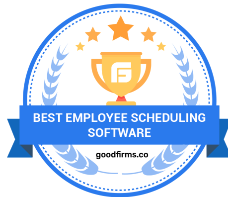
Best employee scheduling software_GoodFirms

WASHINGTON DC, WASHINGTON, UNITES STATES, September 17, 2021 /EINPresswire.com/ -- Many businesses and companies, are adopting employee scheduling tools to automate the staff schedule processes, improve communication, increase productivity, produce consistent results, and manage labor costs. Moreover, it also helps the manager make time and focus on their day-to-day operations and keep track of deadlines and priorities.