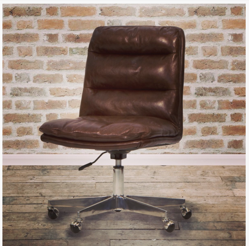
The Hallam Office Chair is a simple creature, and therein lies its success.

Tranquillity, usability and style should all come as standard when planning your office. Thankfully Smithers of Stamford have created the ultimate office chair that boasts of luxurious comfort, practicality and retro styling to die for.