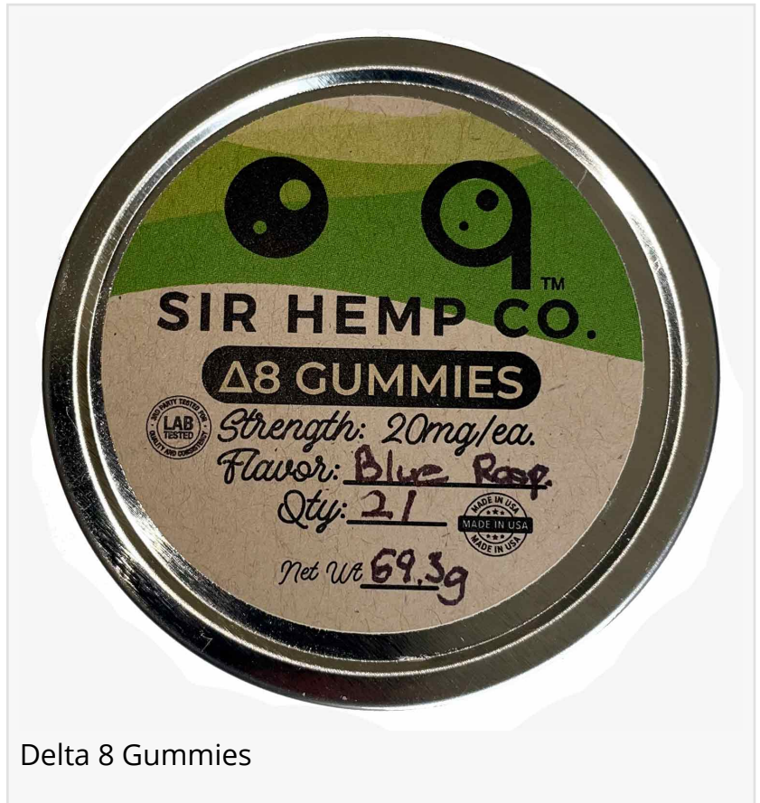
Delta 8 Gummies