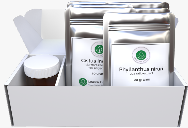
ShieldsUp! Immune Support Kit from Linden Botanicals