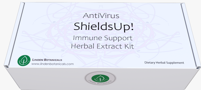
ShieldsUp! Immune Support Kit from Linden Botanicals

This press release can be viewed online at: https://www.einpresswire.com/article/551765951 EIN Presswire's priority is source transparency. We do not allow opaque clients, and our editors try to be careful about weeding out false and misleading content. As a user, if you see something we have missed, please do bring it to our attention. Your help is welcome. EIN Presswire, Everyone's Internet News Presswire™, tries to define some of the boundaries that are reasonable in today's world. Please see our Editorial Guidelines for more information. © 1995-2024 Newsmatics Inc. All Right Reserved.