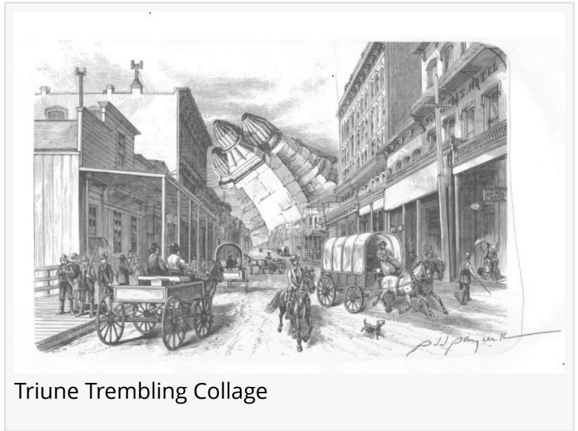
Triune Trembling Collage

This press release can be viewed online at: https://www.einpresswire.com/article/551823017