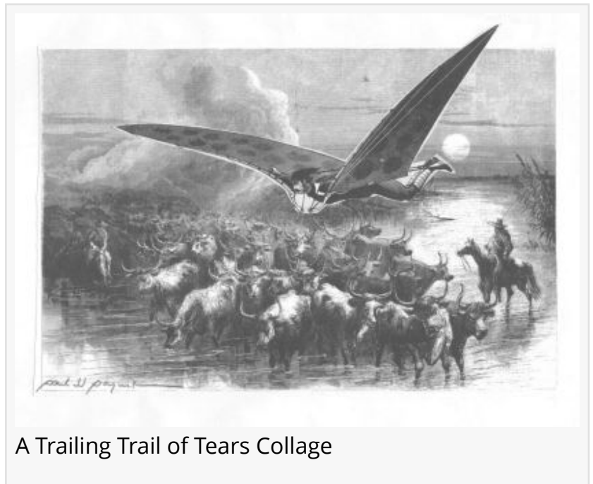
A Trailing Trail of Tears Collage