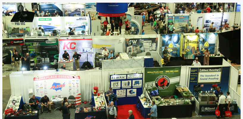
The International Boatbuilders' Exhibition and Conference (IBEX) is North America's largest technical trade event and platform for professionals in the leisure marine equipment industry.