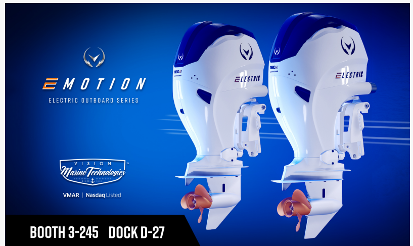
E-Motion Outboard Motor (100% Electric) (VMAR) listed on NASDAQ