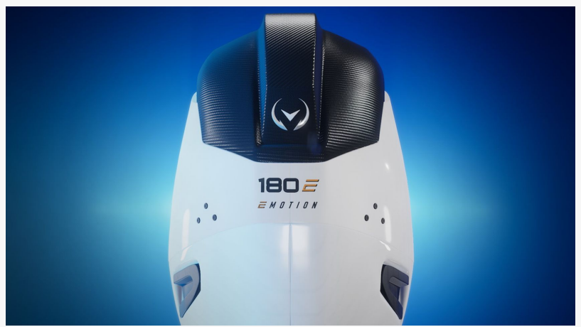
E-Motion 180E Outboard Motor 100% Electric

Vision Marine Technologies, Inc. (Nasdaq: VMAR), strives to be a guiding force for change and an ongoing driving factor in fighting the problems associated with waterway pollution by disrupting the traditional boating industry with electric power, in turn directly contributing to zero pollution, zero emission and a noiseless environment. Our flagship outboard powertrain (“E-Motion™”) is the first fully electric purpose-built outboard powertrain system that combines an advanced battery pack, inverter, and high efficiency motor with proprietary union assembly between the transmission and the electric motor design utilizing extensive control software. Our E-Motion™ and related technologies used in this powertrain system are uniquely designed to improve the efficiency of the outboard powertrain and, as a result, enhance both range and performance. Vision Marine continues to design, innovate, manufacture, and sell handcrafted, high performance, environmentally friendly, electric recreational power boats to customers. The design and technology applied to our boats results in far greater enhanced performance in general, higher speeds, and longer range. Simply stated, a smoother ride than a traditional internal combustion engine (ICE) motorboat.