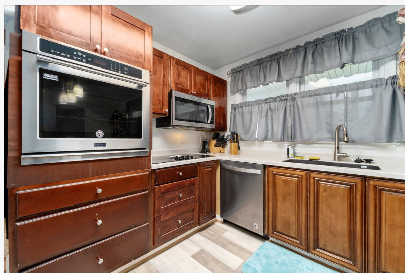
225 Cheyenne Rd., Virginia Beach, VA 23462