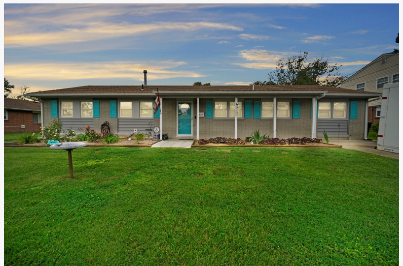
225 Cheyenne Rd., Virginia Beach, VA 23462