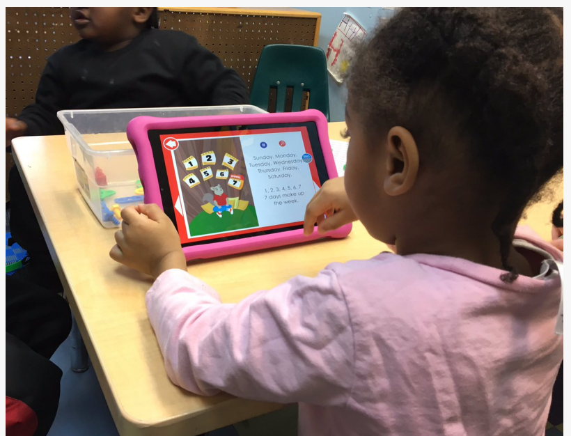
Student using Footsteps2Brilliance literacy app.

children birth-3rd grade with Footsteps2Brilliance's comprehensive bilingual literacy apps to prepare them for kindergarten and third-grade reading proficiency. The apps were accessible on any smartphones, tablets, and computers that families already owned.