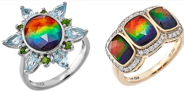
GEMXX Gold and Silver Ammolite Rings

GEMXX is a public traded, mine to market gemstone and jewelry producer with global reach that owns mining, production and operating assets. GEMXX controls each stage of its production including excavation, gemstone production, jewelry manufacturing and global distribution. GEMXX has over 160 years of combined Ammolite management, operations and sales experience. The teams' experience covers every aspect of the Ammolite business ensuring maximum control of the company's product development, quality control and profits. GEMXX management is proud of their environmental stewardship and ethical mining and production standards as the company sets the standard in quality and customer service, providing exquisite fine jewelry and extremely rare, natural decor pieces to customers around the world.