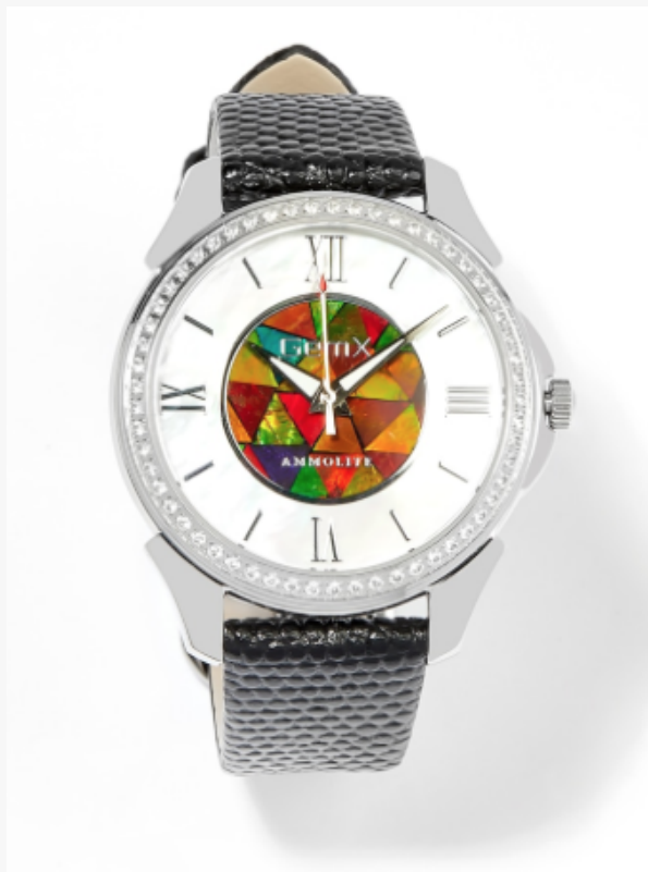
GEMXX Mosaic Ammolite & Sapphire Watch