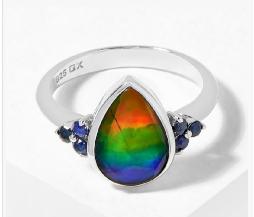
GEMXX Ammolite with Sapphire Silver Ring