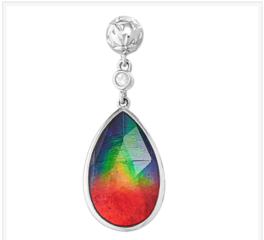
GEMXX Ammolite Silver Pendant

These factors include, but are not limited to, our ability to continue to enhance our products and systems to address industry changes, our ability to expand our customer base and retain existing customers, our ability to effectively compete in our market segment, the lack of public information on our company, our ability to raise sufficient capital to fund our business, operations, our ability to continue as a going concern, and a limited public market for our common stock, among other risks. Many factors are difficult to predict accurately and are generally beyond the company's control.