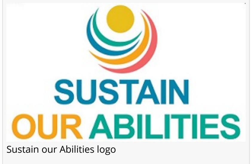
Sustain our Abilities logo