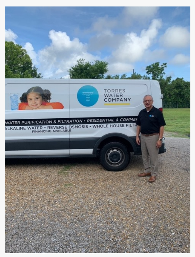
Torres Water Company offers a Free Water Analysis - valued at $ 125.

Calcium and minerals build up in pipes causes appliance failure.