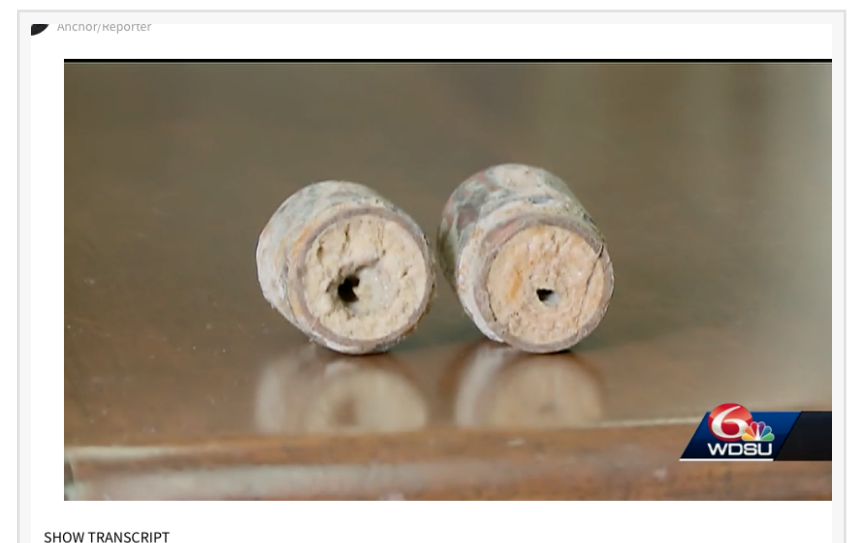
alcium and minerals huild un in r