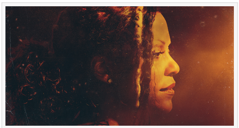
Cover art for Errow's New Single "Mistaken Identity"

RENO, NEVADA, UNITED STATES, September 21, 2021 / EINPresswire.com/ -- Errow was born and raised in north Chicagoland and she doesn't remember a time when she wasn't singing. Classically trained in grade and high school, she then moved into jazz and pop studies in college.