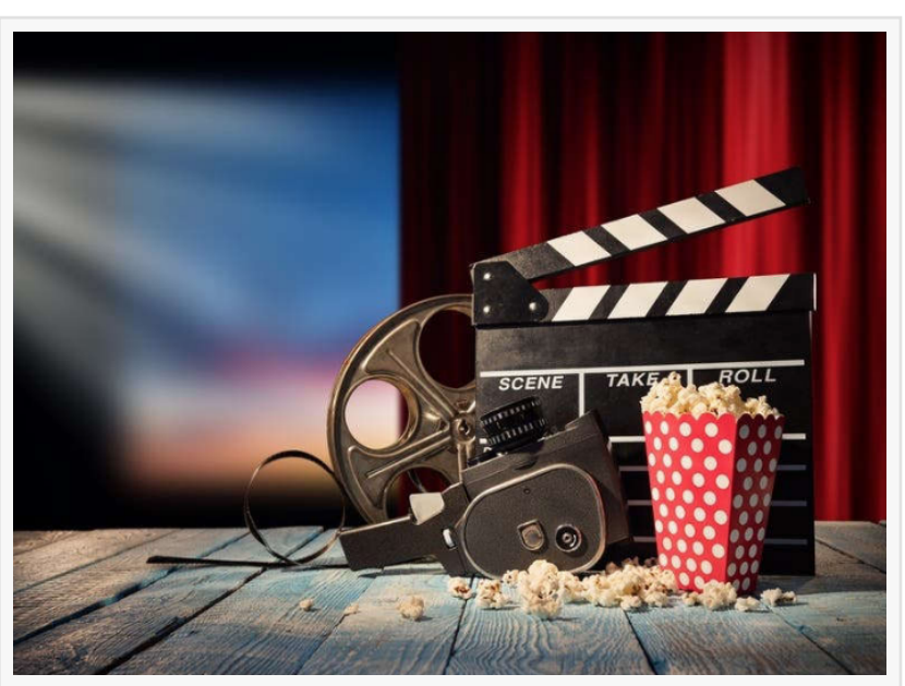
Join the excitement at the Austin Action Fest, September 24–26! Visit bit.ly/3zvxKKc for more information.

CROWN POINT, INDIANA, USA, September 23, 2021 / EINPresswire.com/ -- It's the rare independent film that achieves nearuniversal praise from audiences AND critics, but the <u>RomCom</u> "The Misadventures of Mistress Maneater" is doing just that, and will be featured featured during the Austin Action Fest and Market, being conducted September 24-26, in Austin's famed Domain Marketplace. The Fest is in its fifth year, and is a showcase for up-