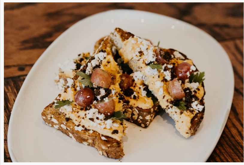
Fairgrounds Sweet Potato Toast

For more information visit Fairgrounds.com and follow us on <u>Instagram</u>, TikTok, Facebook and Twitter.