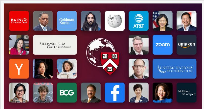
The HPAIR 2021 Conference Welcomed Keynote Speakers and Leading Organizations from Around the World to its Summit