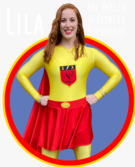
Lila - Wellness & Fitness Superhero