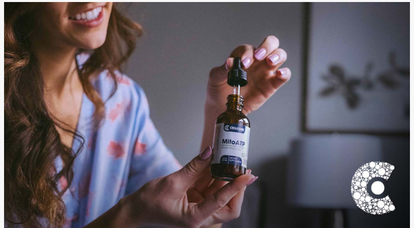
Original CellCore MitoATP Formula Returns

The original formula of MitoATP will be distributed again for all orders placed after September 20, 2021. You can learn more about MitoATP and other products on the CellCore website ( https://cellcore.com/collections/products ).