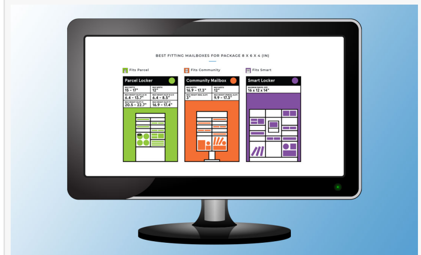
The Right Mailers™ calculator helps e-commerce businesses determine what delivery receptacles their packaging can fit in.