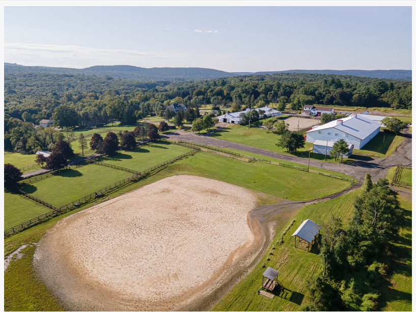
44.6+- Acre Preserved Equestrian Farm

WEST MILFORD, NEW JERSEY, USA, September 22, 2021 / EINPresswire.com/ -- Max Spann Real Estate & Auction Co is pleased to announce the upcoming Auction of a major equestrian farm on 44.6+/- acres located in West Milford Township, Passaic County. The preserved farm will be sold in an online only Auction concluding Wednesday, October 13, 2021 at 11:00AM. Bidders may bid on their computer or through the Max Spann phone app.