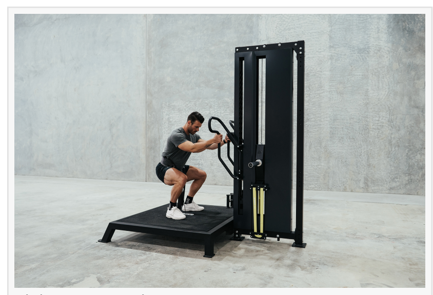
AlphaFit Core Belt Squat

Sure to become an indispensable piece of equipment in any commercial gym,