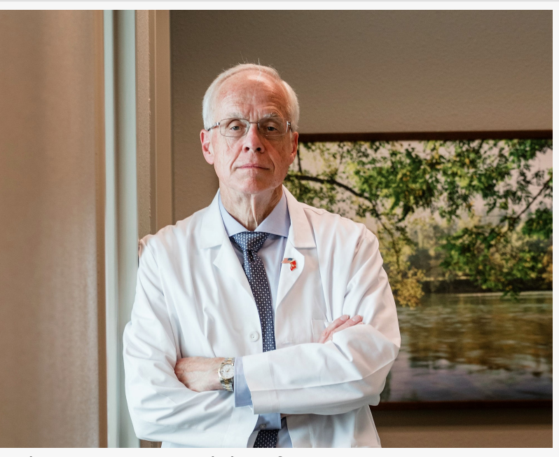
Bud Pierce, MD, Candidate for Oregon Governor

"Portland's crime wave is a direct result of its cutting back on law enforcement last summer. Some of the city's leadership can't seem to make that connection. Law enforcement must have the proper resources and training necessary to combat this surge of violence. They also must have a government that supports them, not demonizes them. You don't have a civilization when you don't have public safety," Pierce's statement concluded.