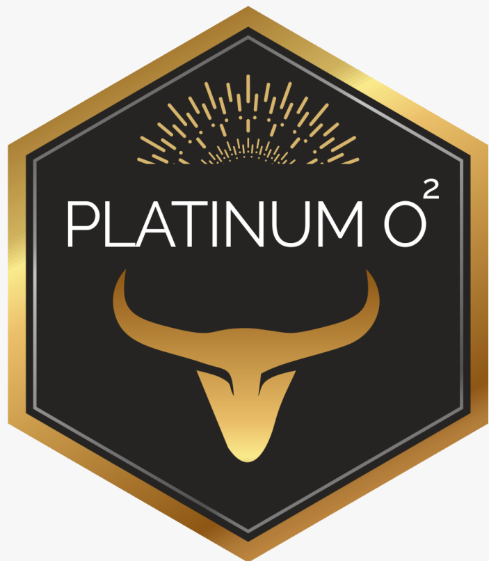
PlatinumO2 Crypto Token