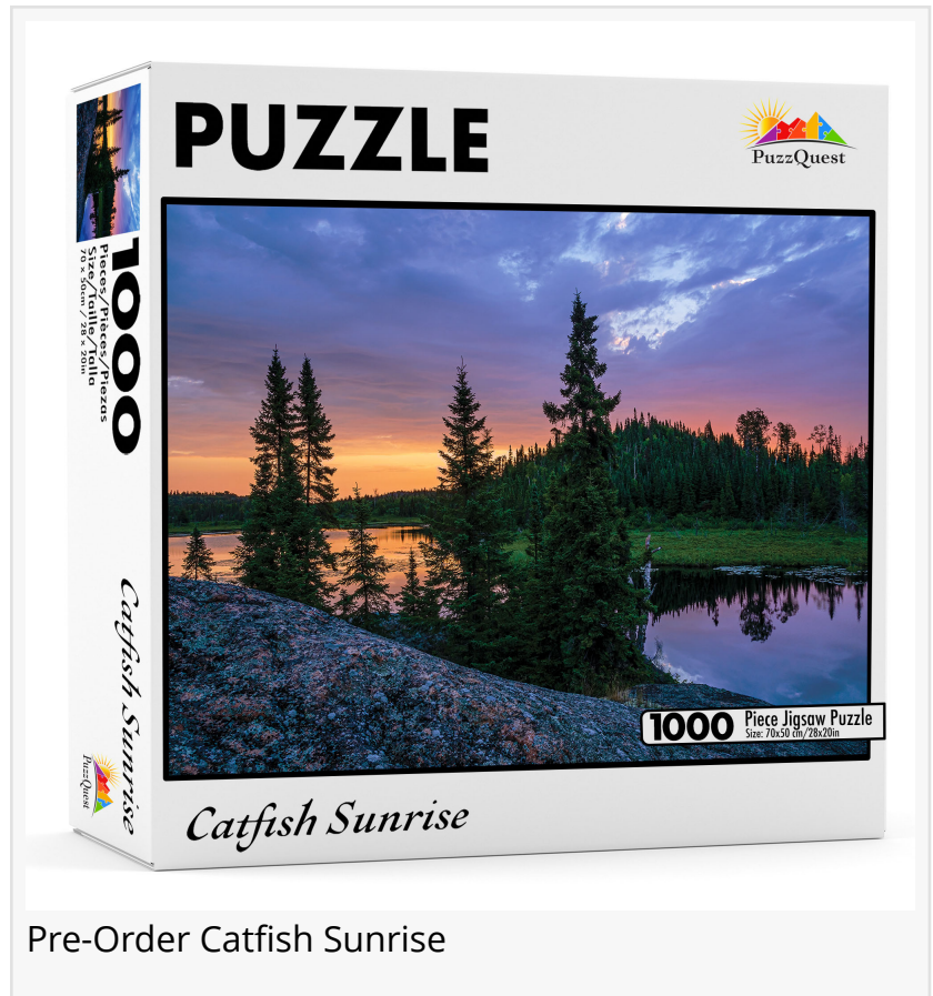
Pre-Order Catfish Sunrise

PuzzQuest seeks out unknown artists and hidden gems and turns their work of art into creative puzzles, allowing unknown but passionate creators to share their works of art worldwide. PuzzQuest was born out of a love of art, from painting to photography, sculpture, and design. Being surrounded by art adds pleasure to daily life.