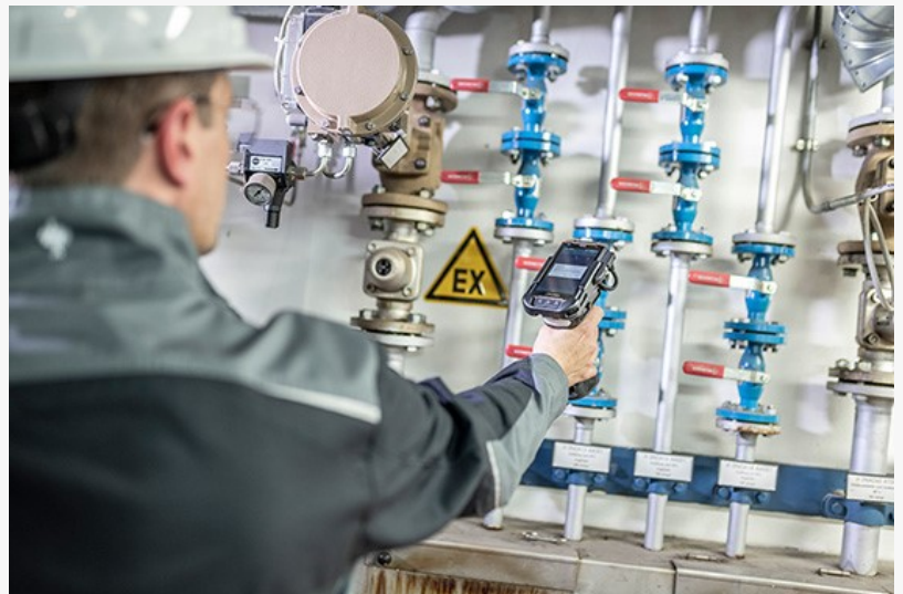
i.safe MOBILE_Mobile Data management ex-area