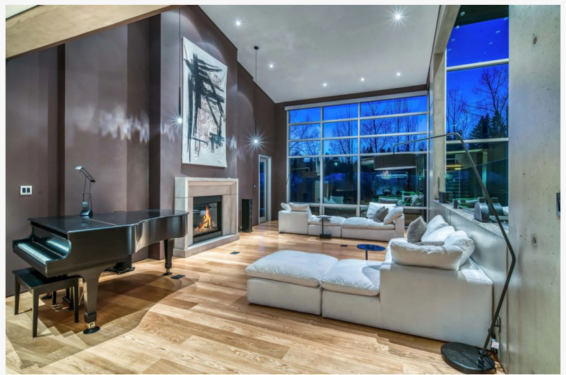
10ft+ vaulted and barreled ceilings and designer finishes

Concierge Auctions is the world's largest luxury real estate auction firm with a state-of-the-art digital marketing, property preview, and bidding platform. The firm matches sellers of one-of-a-kind properties with the most high-net-worth property connoisseurs on the planet. Sellers gain unmatched reach, speed, and certainty. Buyers get incredible deals. Agents earn their commission in 30 days. Since its inception in 2008, Concierge Auctions has generated billions of dollars in sales, broken world records for the highest-priced homes ever achieved at auction, and grown its activity in 44 U.S. states/territories and 29 countries. The firm owns the most