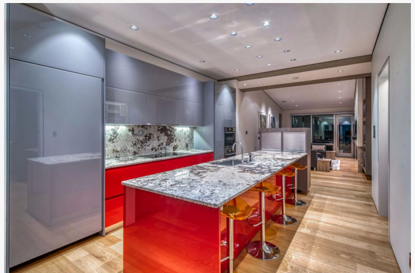
Ultra-modern kitchen with granite and designer appliances