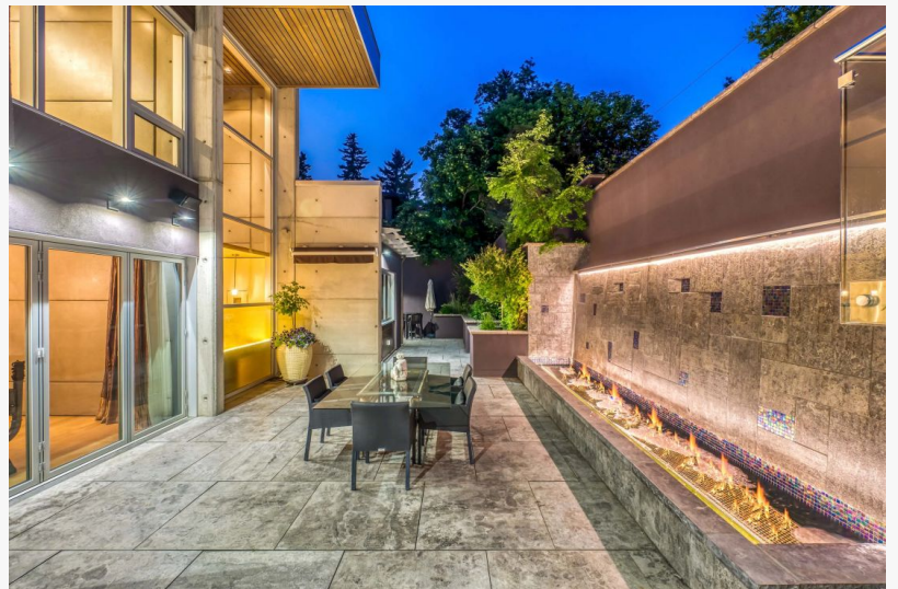
Incredible entertainment spaces

This press release can be viewed online at: https://www.einpresswire.com/article/552253536 EIN Presswire's priority is source transparency. We do not allow opaque clients, and our editors try to be careful about weeding out false and misleading content. As a user, if you see something we have missed, please do bring it to our attention. Your help is welcome. EIN Presswire, Everyone's Internet News Presswire™, tries to define some of the boundaries that are reasonable in today's world. Please see our Editorial Guidelines for more information. © 1995-2021 IPD Group, Inc. All Right Reserved.