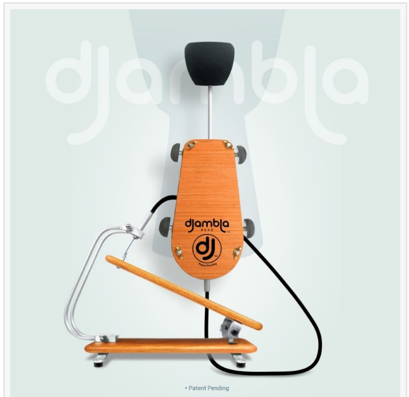
The Djambla & drum