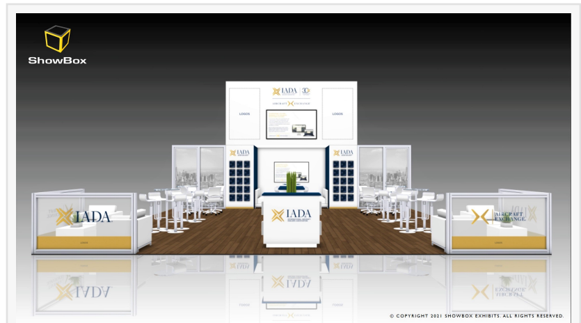
Another View of IADA's Inaugural NBAA-BACE Booth

Advocate Consulting Legal Group, PLLC AssuredPartners Aerospace AOPA Aviation Finance Company Aviation Partners, Inc. (API) CAMP Systems International Elliot Aviation Engine Assurance Program (EAP) Enterprise Bank & Trust Gilchrist Aviation Law, PC Honeywell Aerospace Insured Aircraft Title Service, Inc. International Jet Interiors Jet RVSM Services, LLC