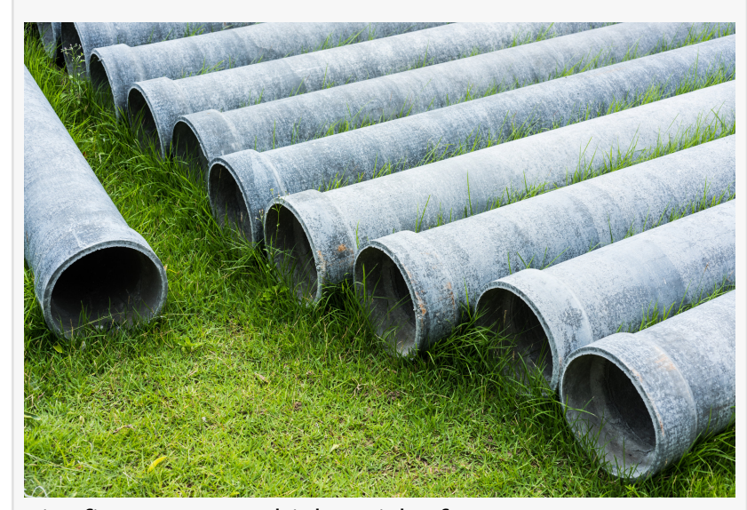
Pipefitters are at a higher risk of exposure to asbestos than most due to the hands-on nature of the job.

Hospice, St. Thomas Hospital, Timken Mercy Hospital, Tuscarawas Valley High School, Wooster College, Ross County Medical Center, Butler County Jail, Cincinnati City Hall, Cincinnati Country Club, Cincinnati General Hospital, Crest Hills Junior High School, East Evanston Elementary School, Raymond Walters College,