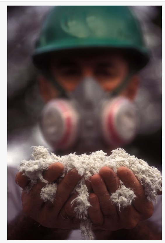
Inhaling one fiber of asbestos is enough to cause mesothelioma decades later.

Jobsites and locations with known asbestos exposure in Ohio include, but are not limited to, NASA Glenn Research Center, Akron Children's Hospital, Akron City Hospital, Akron General Hospital, Peoples Hospital, Akron Steel Treating Plant, Akron University, Gorge Powerhouse, Alliance Research Center, Mount Union College, Ashland College, Ashland High School, Ashland University, Ashtabula General Hospital, Ashtabula Powerhouse, Ashtabula Scrap & Reclamation Plant, Great Lakes Engineering Works Shipyard, Athens State Hospital, Ohio State University, Avon Lake Power Plant, Ann Dean Farm, Barberton Citizens Hospital, Barberton High School, Paul Henry Ice Plant, Bedford High School, Hawthorne Valley Club, Beverly Powerhouse, Bluffton College, Bowling Green State University, Broadview Heights Hospital, Tidd Plant, Cardinal Powerhouse, Cambridge State Hospital, Salt Fork State Park, Apple Creek State Hospital, Aultman Hospital, Bell Stone School, Canton South High School, Cloverleaf High School, Dover Library, Dunlap Hospital, New Philadelphia School, Mansfield Hospital, Longcoy Elementary School, Lima State Hospital, Kent State University, Holmes East High School, H. A. Preston School, Reynolds Memorial Hospital, Stark County Jail, St. Thomas Aquinas High School, St. Joseph