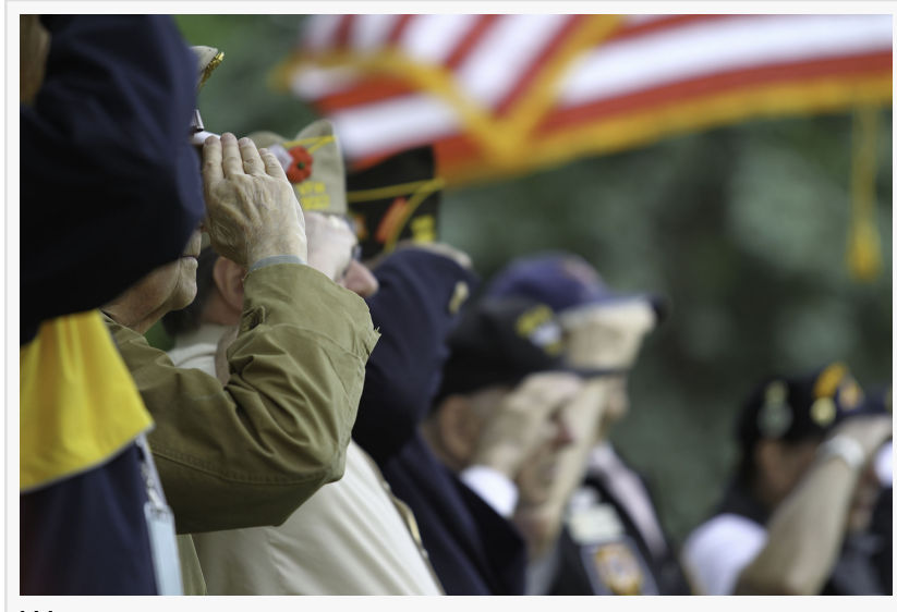
We support our veterans.