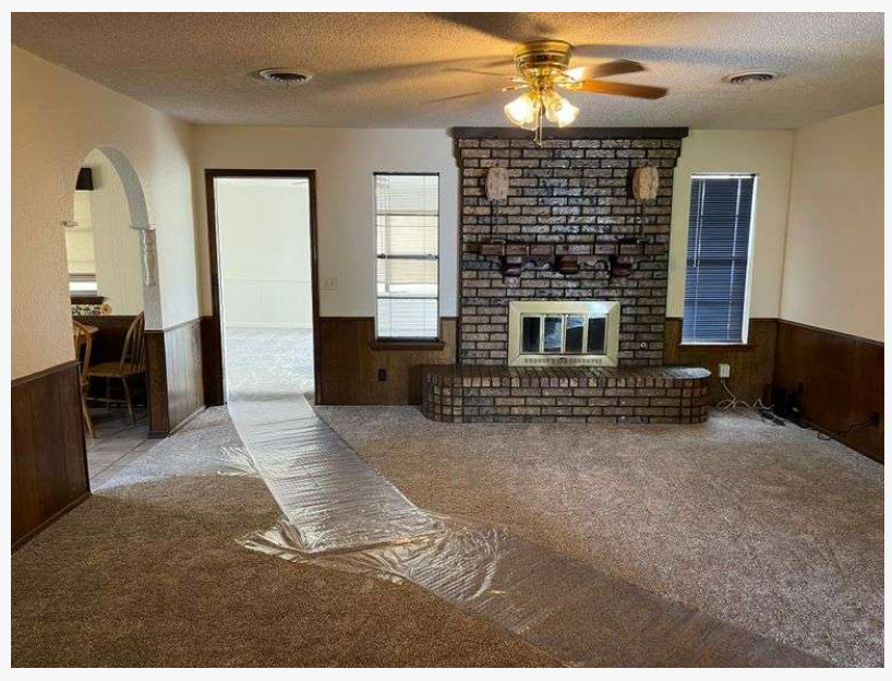
2801 James Louis Drive, Amarillo, TX 79110

our highly experienced marketing staff and internationally award-winning auctioneers know that every auction is unique and conduct skillfully managed, highly professional events while ensuring that our clients receive the results they desire. Are you thinking of selling? For more information about Assiter Auctioneers, visit <u>www.assiter.com</u> or call 806.655.3900.