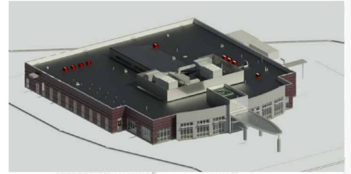
Top View of the Project