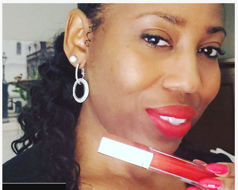
Meet The BEAUTY Behind The Brand!