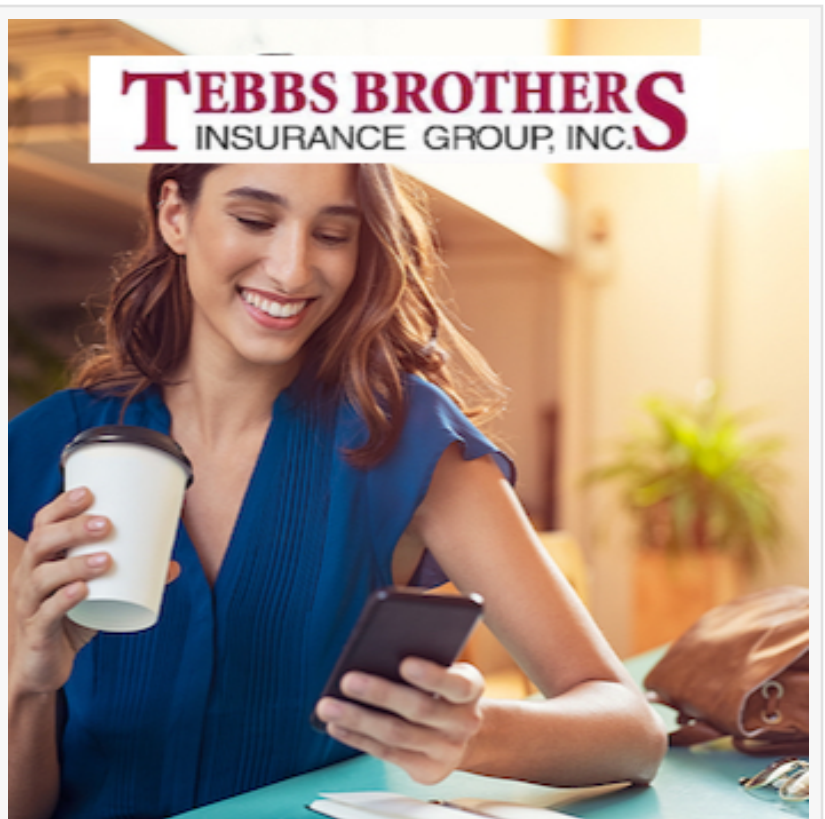
TEBBS Bros: UTAH's #1 BUSINESS Home Life Auto INS

Although physically located in Holladay, TBIG proudly offers their professional, family-based insurance services to residents of: Millcreek, Cottonwood, Draper, Murray, Midvale, Sandy, Woodridge Terrace, South Jordan, Sugarhouse, Taylorsville, South Salt Lake, West Jordan, Alpine Gardens, in addition to West Valley and Magna.