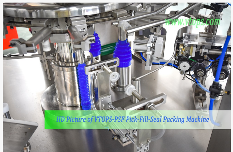
Pouch Opening Device of Pick Fill Seal Packaging Machine