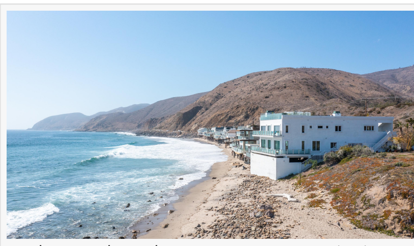
Unobstructed 360-degree ocean-to-mountain views

A second incredible offering, design the oceanfront retreat of your dreams on a rare 1.2-acre flat-beach land plot.