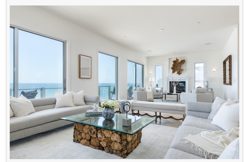
Ocean views from every room, soaring ceilings & grand scale entertaining areas, & over 5,000sf

This incredible slice of paradise boasts 125 feet of beachfront with unobstructed 360-degree ocean-to-mountain views. Whether you dream of adding a pristine and private pool, sprawling tennis court, and organic garden to the existing 42500 Pacific Coast Highway home next door, constructing an exclusive long-term summer rental for economic and investment potential, or wish to build the existing Doug Burdge-designed plans, Malibu's top architect, for the oceanfront compound of your dreams consisting of three stories and 10,000+ square feet. It can all be done with the added opportunity to live on-site while construction is underway.