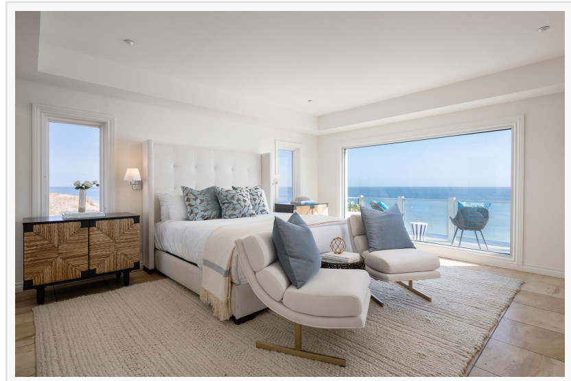
Set on beach at point of County Line surfing beach

kite boarding. Venture further and you'll find several other of Malibu's most beautiful beaches within minutes, including Leo Carrillo State Beach, El Matador Beach, and La Piedra Beach. Head inland for hiking trails that weave through the canyons, waterfalls, and the grasslands of the Santa Monica National Park. Answer the siren's call of downtown L.A. at a moment's notice, or head to the skies with convenient proximity to LAX. If private jet suits your needs, nearby Camarillo Airport, just 16-miles away, provides an unmatched opportunity to set off