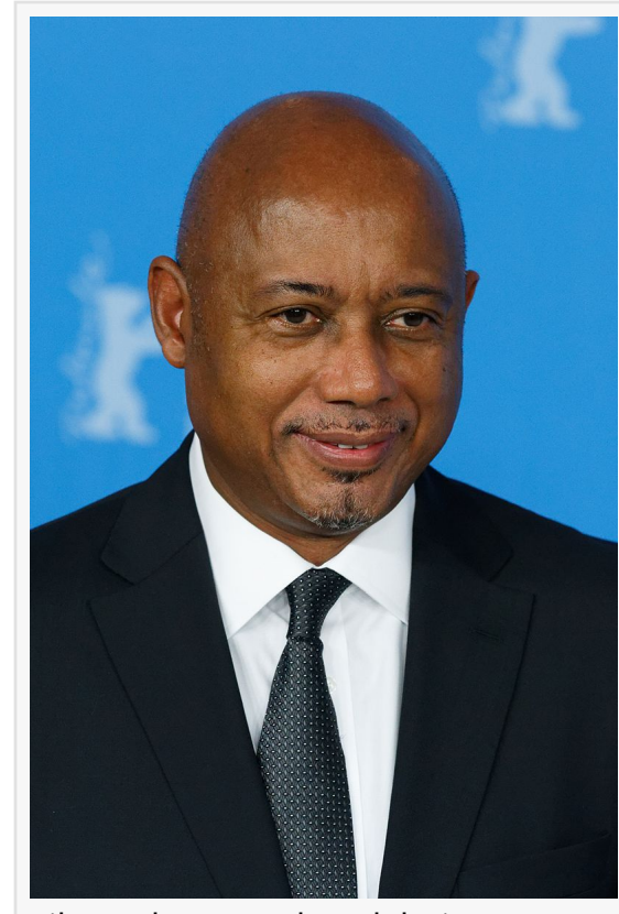
Filmmaker Raoul Peck being Honored

"The Lake Placid Film Festival is proud of this 20th anniversary event," Smith says. "We're proud to celebrate the community of film industry amateurs, professionals